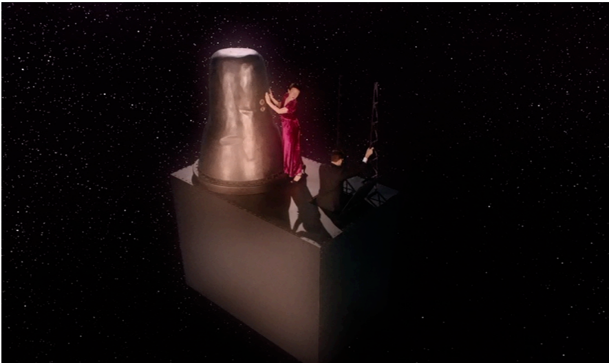
Red velvet gown in starry sky with golden object

What Baudelaire could only achieve within the limits of the written word and the tonality of poetry, Lynch and Frost could fully realise in their cinematographic aesthetics and they have done so much more in season three than in the preceding ones. I would therefore argue that in The Return , the need for an expression of the ongoing language trouble appears to be even bigger than in seasons one and two, which means in turn that the symbolic in 2017 32 is even more threatened than back in 1989/90. The Return is therefore to a much greater extent than the previous seasons dominated by a growing autonomy of sound and of ‘arabesque’ images. If lines and movements floated independently within the realm of the verse in Baudelaire, in the third season of Twin Peaks , surrealist images of intense, contrasting colors or of black-and-white images with golden tinted objects float rather independently between the loose ends of the story.