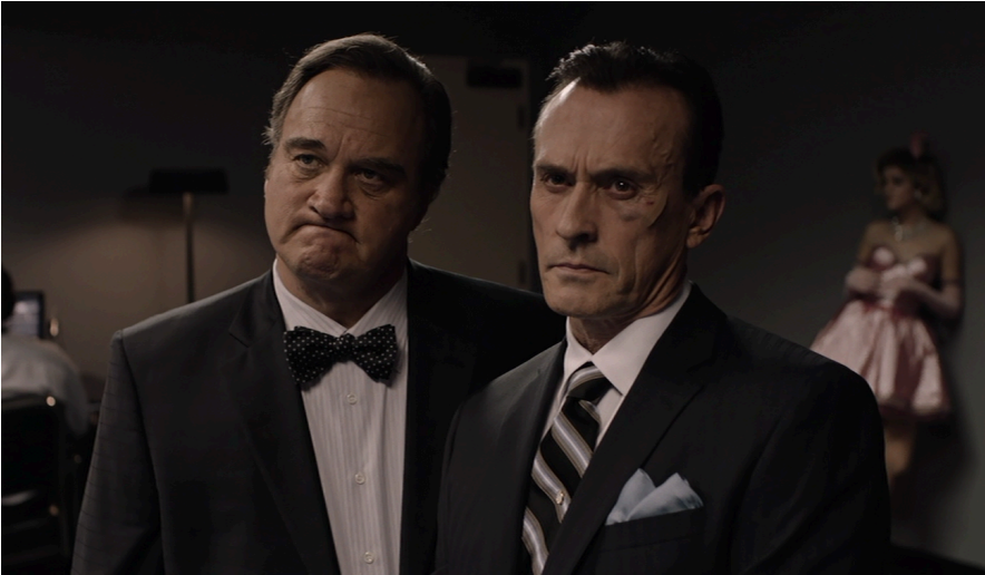
The Mitchums unable to understand what Candie does

The Mitchum brothers for instance, fail to communicate efficiently with their assistant Candie who usually appears accompanied by her identically dressed colleagues Mandie and Sandie—another peculiar ‘trptych’ mirroring the three Coopers. Candie seems constantly distracted and moony, almost mute—like Johnny Horne—and not reacting at all or with great delay to the Mitchum’s pleas. 28 When she finally engages in verbal interaction with Cooper/Dougie’s corrupt colleague Anthony (Tom Sizemore) upon their request, the brothers see her through a monitor, talking and making mysterious gestures, without being able to gather the content of the conversation.