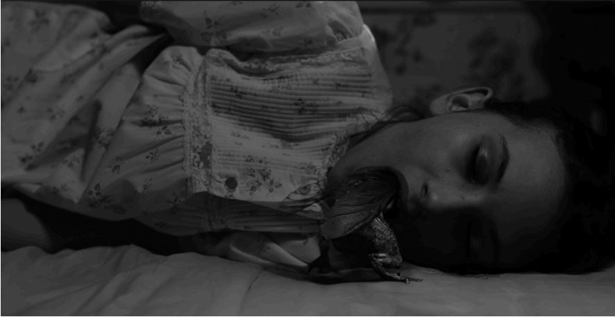
Ominous creature crawling into girl's mouth

The arabesque images are hyperbolic excrescences of a world that can no longer be described within the realm of the fantastic, the melodramatic and the comical, like it may have been the case back in 1989/90. Rather, the excessive character of a society which loses its connection to a stable position within a now equally unstable symbolic order; or a society, which is on the verge of getting rid of this order altogether and to trade it for unleashed jouissance , can only be described by mute images and, as their counterpart, by penetrating sounds that have no obvious connection to the histoire . Creaking, swooshing, humming, buzzing, whirring or whistling noises 33 are present in almost every episode of the third season and they do not necessarily contribute to solving the multiple riddles presented on the level of the story. They are acoustic arabesques and in this sense they serve as a constant reminder of the Real in the Lacanian sense: they are a surplus of the excess that haunts the series; an excess that can be traced back to the basic tension of the homo duplex in Baudelairean poetry.