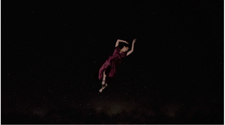
Naido falls into the sky