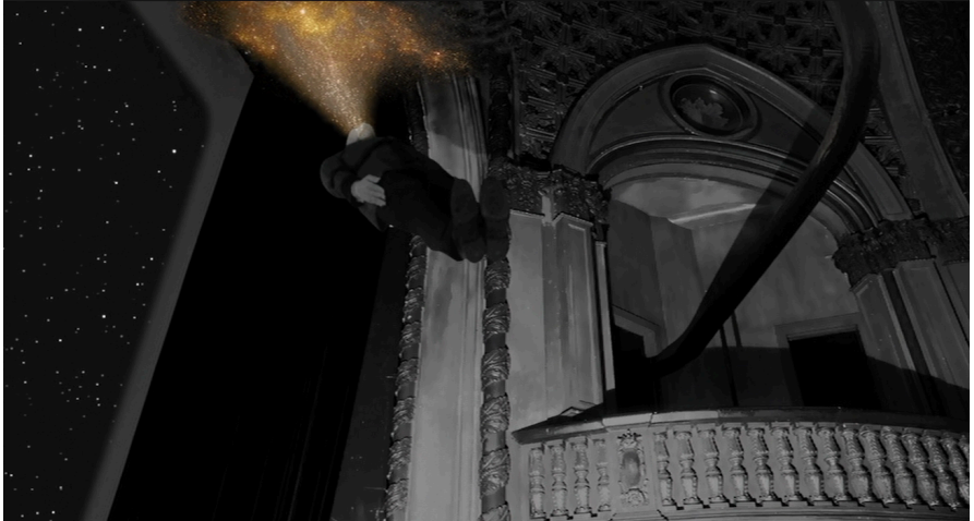
The Fireman, a rain of fire and the stars