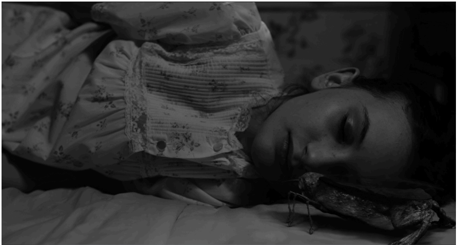
Kafkaesque chimeric creature