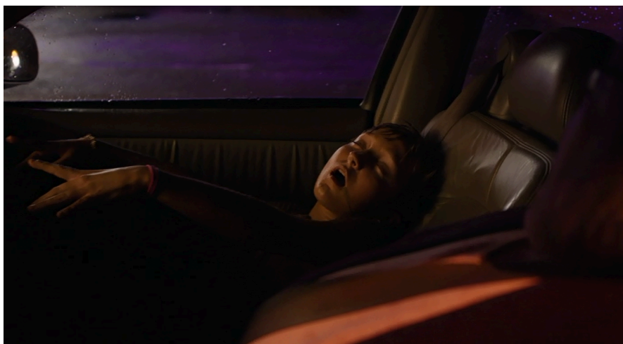
The zombie girl

One of the many small yet effectively disturbing scenes of The Return is situated right after the young boy mentioned above, who took the gun of his father, fired several times into the Double R diner. What follows the identification of the young shooter on behalf of Bobby is a chaotic traffic jam, with drivers repeatedly honking their horns. As Bobby takes a look to see what is going on in one of the cars, he is confronted with a woman who continually honks while screaming maniacally that she needs to go home. Bobby Briggs then sees a zombielike young girl in the front seat who vomits a large amount of disgusting greenish liquid.