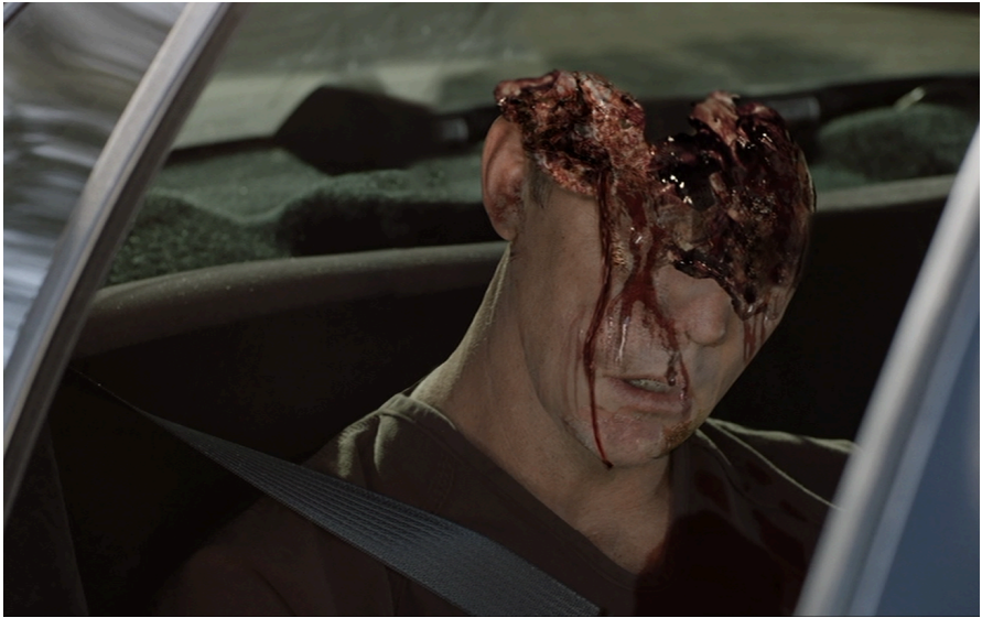
Bill Hastings murdered

make sense of them, even more effectively than they haunt the characters themselves. 3