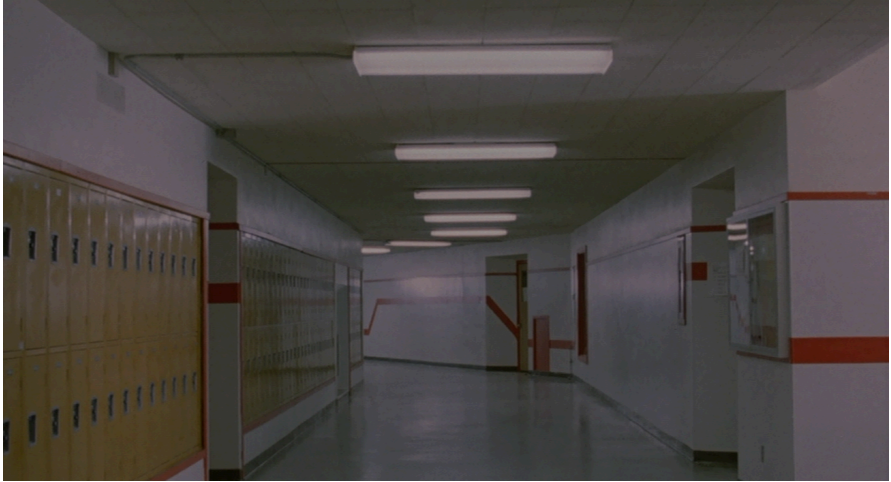
Red lines in school