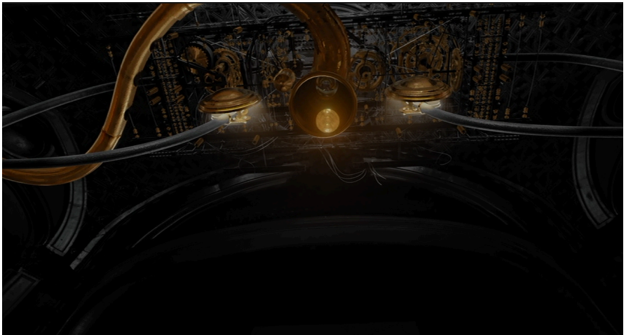
Golden orb and golden horn