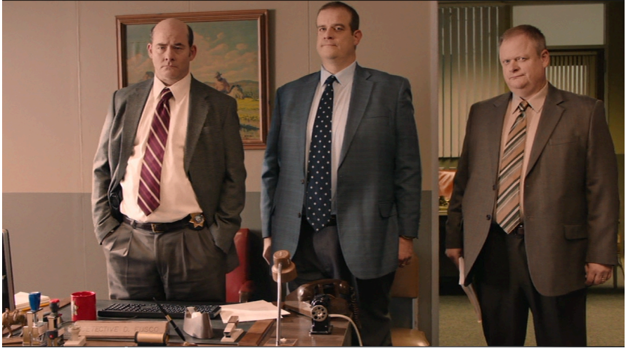
Detective Fusco name plate