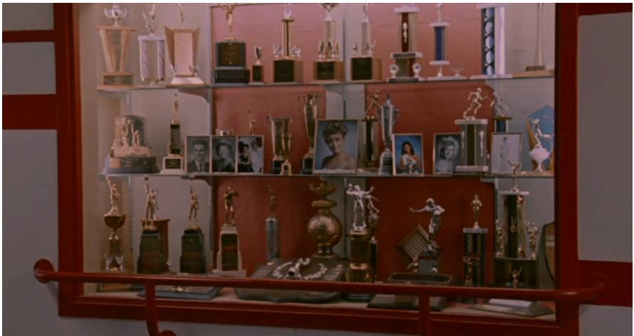
Laura's iconic photograph in red cabinet

This becomes clear if we take a look at Laura's activities in Twin Peaks community services, traditionally one of the most important pillars of a functioning civil society (and hence of the symbolic).