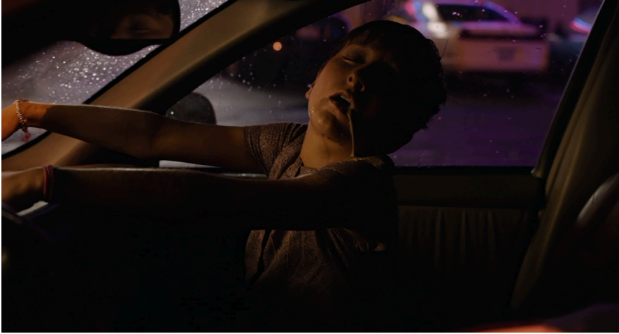
The zombie girl vomiting green liquid

who is ‘undead’ like her, as every time he gets killed, strange bearded creatures appear and cure him. The doppelgaenger is therefore like a vampire who comes back no matter how often you kill him. Second, she represents the “disgusting enjoyment” of the Twin Peaks residents and especially of the young generation; a jouissance that manifests itself in the scenes described above.