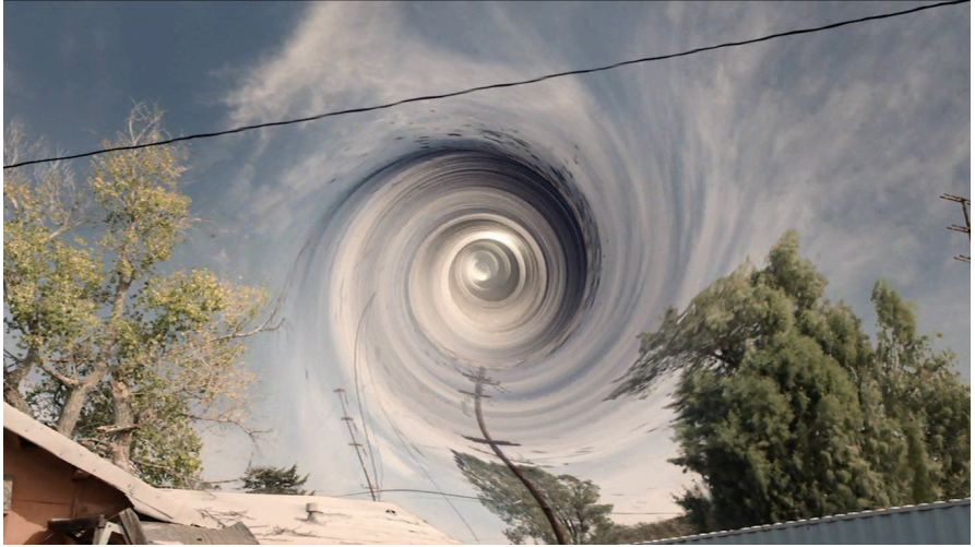
Eye of cyclone in the zone almost devouring Gordon