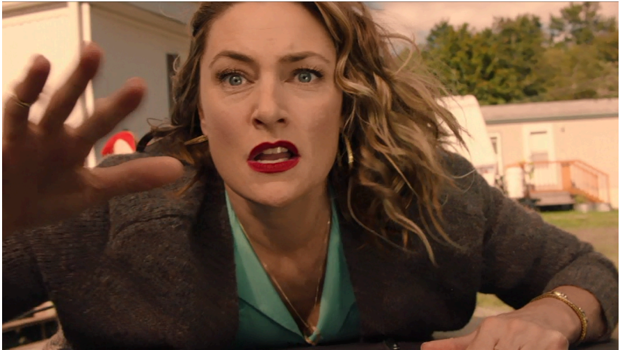
Shelly on Becky's windshield

Last not least, Ben's ruthless grandson Richard (Eamon Farren) probably most prominently fails to comply with the rules and constantly neglects the rules of the symbolic. Beyond his violent and even murderous actions, he ignores the no smoking sign in the Roadhouse and then completely skips the convention of flirting which normally pre-